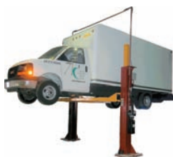
20,000 lb. capacity SYMMETRIC model