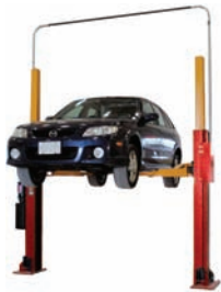
12,000 lb. Capacity SYMMETRIC Model