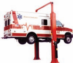
16,000 lb. Capacity SYMMETRIC model