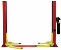
9,000 lb. Capacity Symmetric BASEPLATE Model