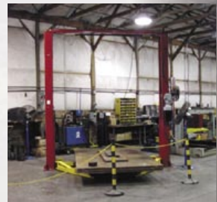
Cycle testing in our R&D facility

21st century design tools allow us to create, control and validate our designs to ensure maximum performance. Forward lifts are rigorously tested to meet quality and durability standards. All product families are proof load tested to 1½ times rated capacity and rigorously cycle tested.